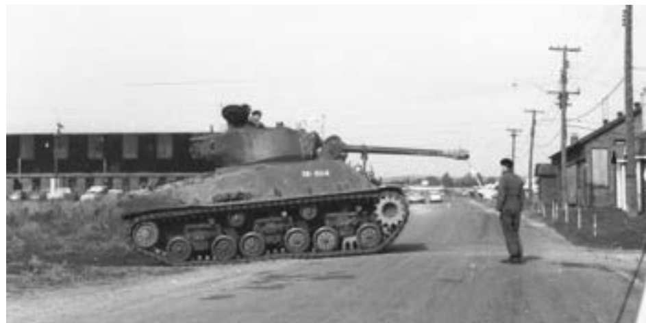
One of the Regiment's Sherman tanks is positioned near the entrance of the tank hanger, out of sight to the viewer's right, in the early 1960s.

Instead of the usual practice of conducting the summer training exercise at a training base, the 1958 camp was conducted at the Oshawa Airport. It was a combined civilian-military exercise that utilized the airport and other local areas to test civil defence procedures. This exercise was the first municipal-level civil defence exercise to be conducted in Canada.