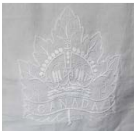
Full bedspread (left), detail of Canadian embroidery panel (above).